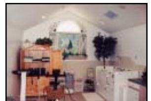
CENTRAL BATHING AREA