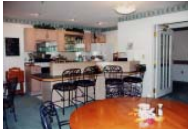
ICE CREAM PARLOR

THE VILLAS AT BATON ROUGE, LTD. 2440 BATON ROUGE AVE LIMA, OHIO 45805