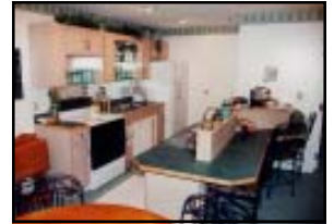
ICE CREAM PARLOR / KITCHEN