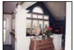
ENTRY AREA / LOUNGE