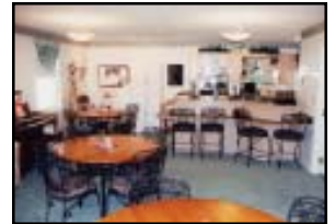
ICE CREAM PARLOR